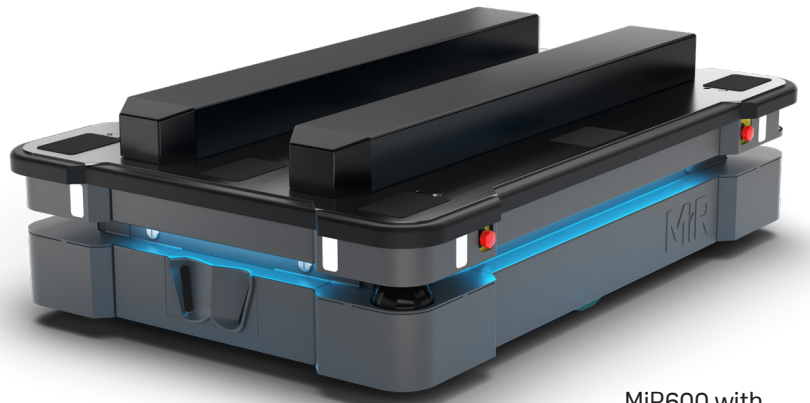
MiR600 with EU Pallet Lift 600

With increased ability to withstand dust particles and fluids, the MiR600 & MiR1350 are industrial, safer, and more reliable than any other AMRs, and they can be used in more environments.